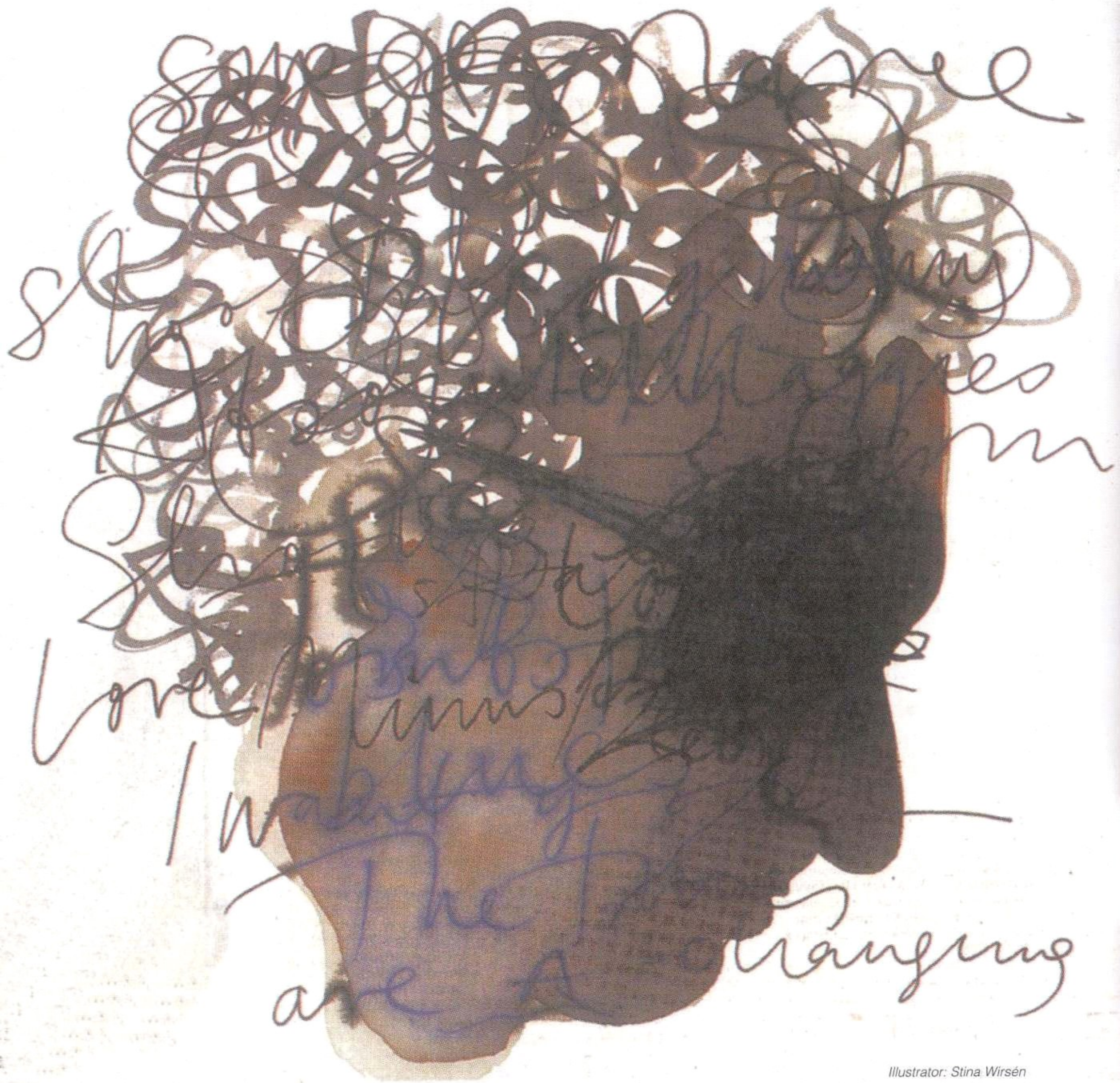
Illustrator: Stina Wirsén